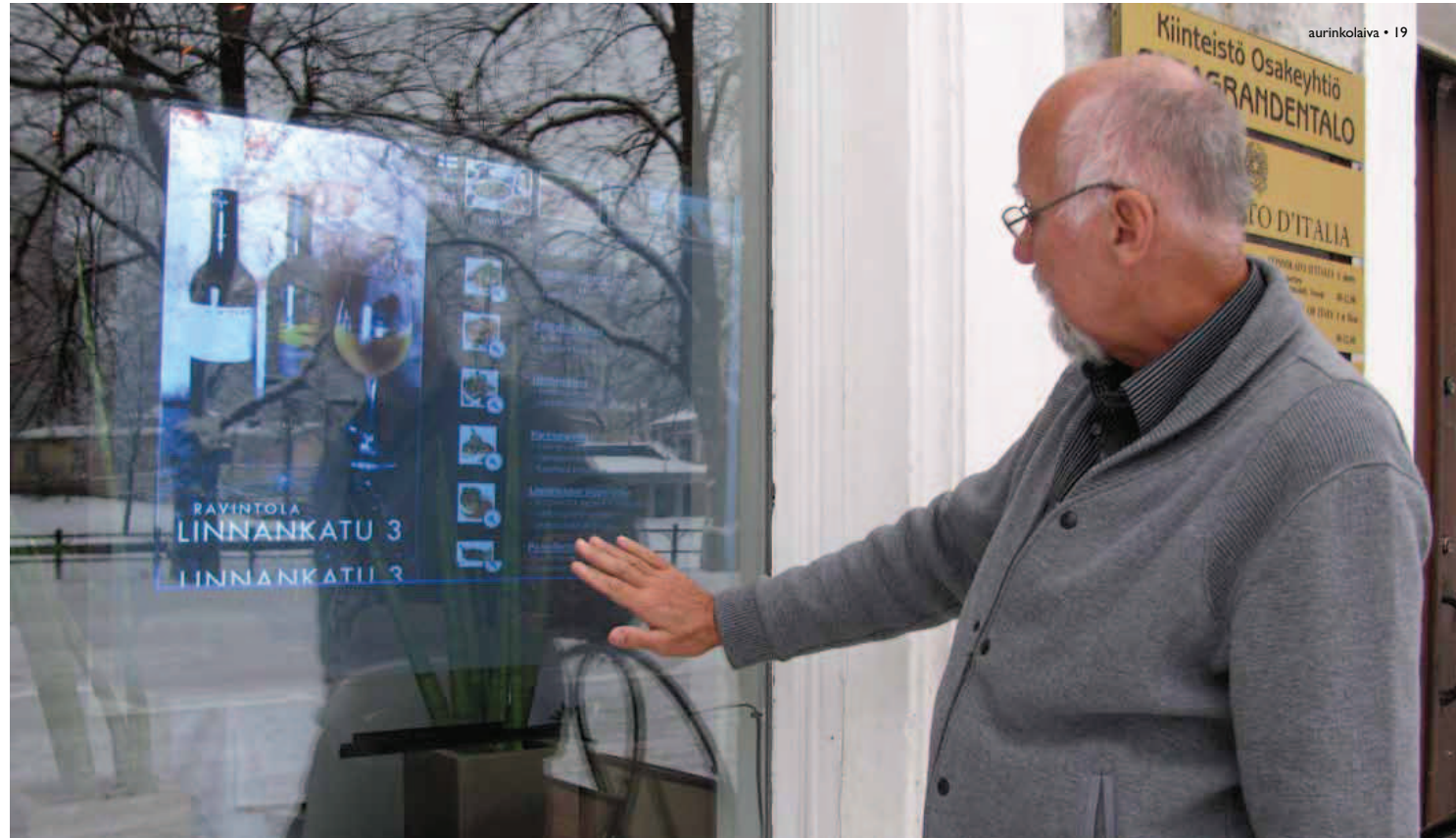
The window screen menu.

According to Tapio Virtanen the Sax3d screen is a big hit in its home market, and has been actively sold all over the world, including the U.S. Resal Oy has laid the groundwork for the import of the product to Finland since last summer, and luckily for the restaurant the screen has already been a source of wonder also at the Habitare Fair.